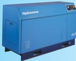
Hydrovane HV11 (Enclosed Option)