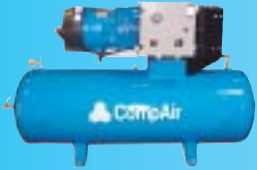
Hydrovane V04 (Receiver Mounted)