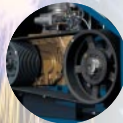
A reliable and highly efficient drive system