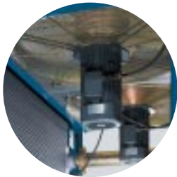
Plant cooling fan. The cool air passing through the unit picks up all radiant heat

Cooling is achieved with an independent, motor-driven fan. Cold air passes over the inside of the package picking up radiant heat so there is no temperature build-up under the canopy. This allows for safe operation in the most arduous conditions.