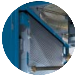
The large aftercooler effectively cools compressed air to as low as 15°F above ambient (dependent on model)

A large surface after-cooler gives the benefits of: