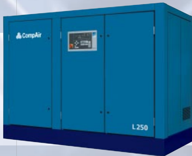
The CompAir L Series. A high capacity air compressor range that sets the highest standards in reliable, economical and efficient operation.