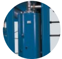
Large reclaimers with generously-sized fine separator elements, large oil coolers and aftercoolers

CompAir employs only the very best manufacturing techniques - your guarantee for reliability and performance